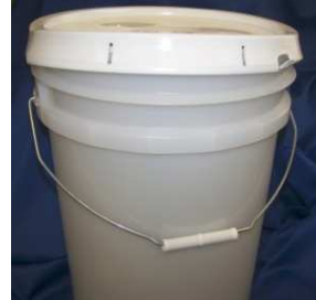
Improperly seated M2 lid: