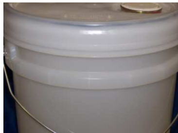
Properly seated M4 lid: