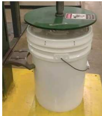
Figure A: Pneumatic Press