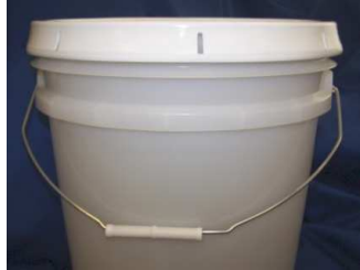
Properly seated M2 lid: